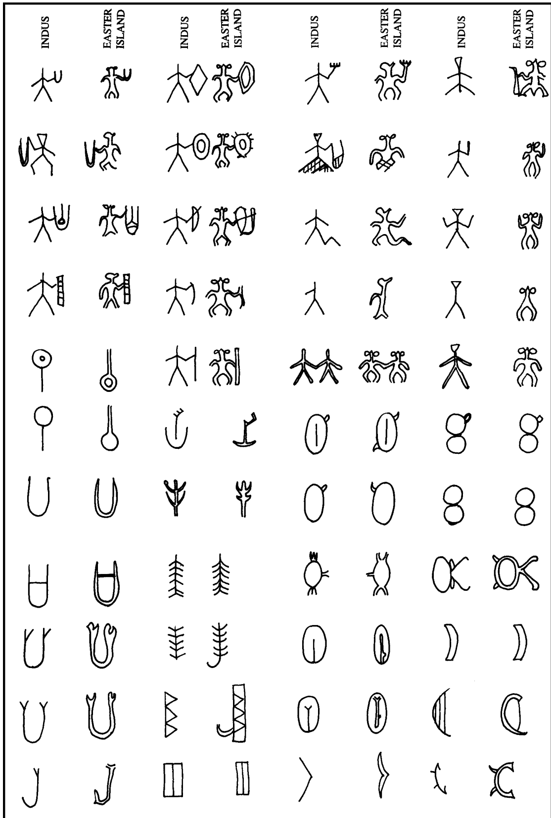
Fig. 4: A comparison between Easter Island and Indus scripts, by de Hevesy 14